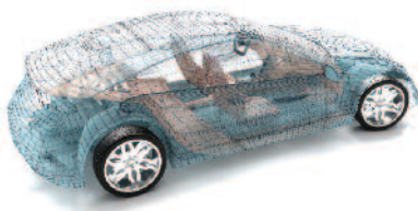
Innovation in materials and engineering techniques must be matched by innovation in metalworking fluids.

On the following pages, the table and graphs will help you identify candidate products in the Q8Oils range. You can verify then your choice by referring to our data sheets which give a detailed profile of each product. Alternatively, you may request a visit from a Q8Oils product specialist to discuss your requirements in more detail (see back page).