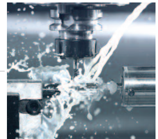
Regardless of the material, machining environment or application, we have a product for the task.

is a range of soluble metalworking grades which are developed to be Formaldehyde Free, TRGS 611 compliant, Chlorine free and Secondary Amine free, tolerant to both Hard and Soft water.