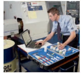
Q8Oils Field Service Technicians are specialists in finding solutions, or improving existing performance.

is a superior range of high performance soluble metalworking grades which are developed to challenge the demands and meet the needs of advanced engineering applications. The range which has an advanced safety profile is fully compliant with environmental and chemical legislation, free from Boron, Boric Acid, Formaldehyde, Chlorine and Secondary Amines, the range is also suitable for use in both hard and soft water.