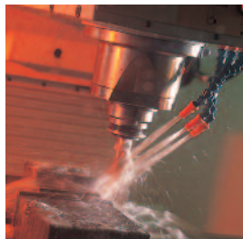
Complex chemistry, new materials and difficult applications require smart engineering solutions.

Metalworking fluids are one of the most complex liquids owing to their chemistry and the environment in which they have to perform. The wide range of materials and applications means that it is not possible to develop one formulation that fits all requirements. It is therefore essential to offer a wide product range so that customers can confidently choose the metalworking fluid best suited to their process and application.